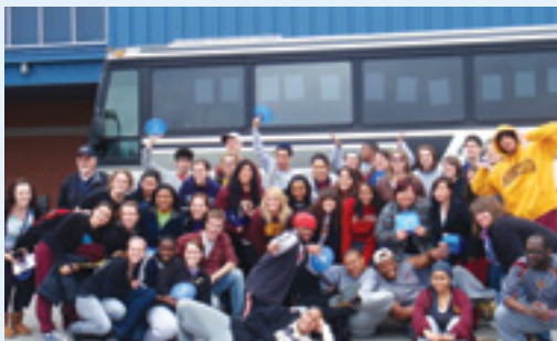
Thanks to the students from the University of Minnesota who helped clean after Casino Night.

More than 500 people attended this year's Casino Night, making it a huge success! This year's event raised more than $40,000 in support of Turnstone's Kimbrough Early Learning Center and our sports and recreation program. Thank you to our sponsors, guests, and the many volunteers who make this event possible. Special thanks to students of the University of Minnesota for helping clean up the day after the event! A full list of Casino Night donors and sponsors will be published in the 2010–2011 annual report.